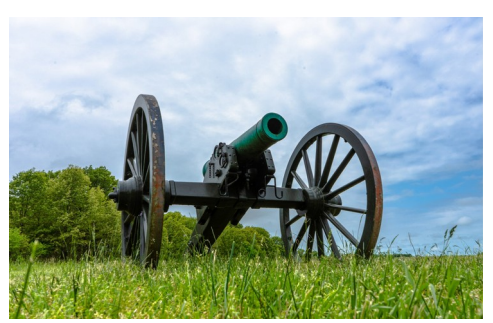
I've also acquired this one in case Tom adds a stake shoot to next years state shoot program