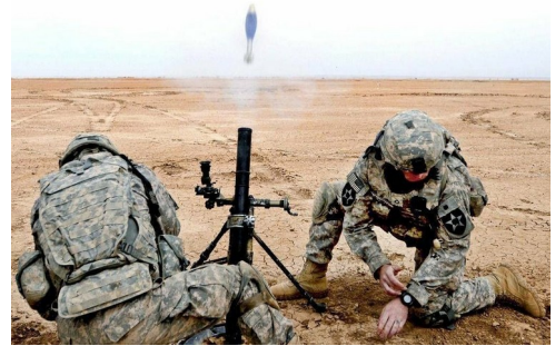
Just took delivery of my new muzzle loader

Contact the Editor if interested editorpokeandstroke@gmail.com